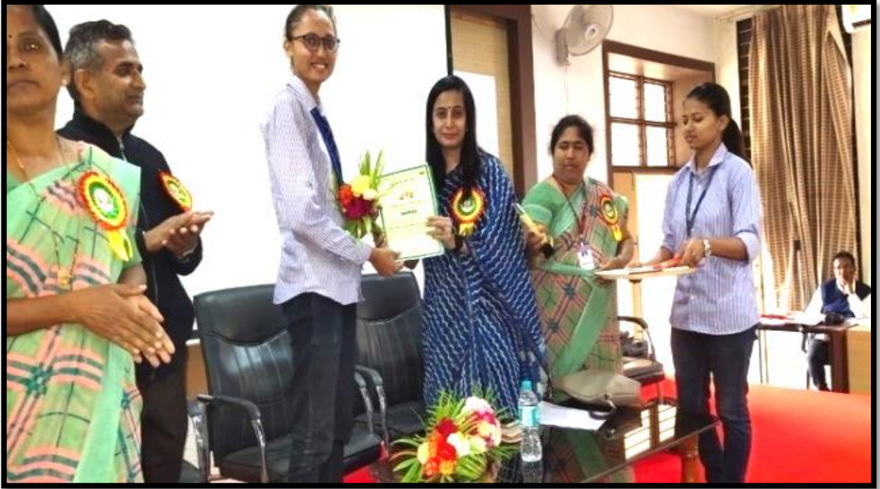
Prize to Miss. Shinde for active participation in Anti Sexual Harassment activities