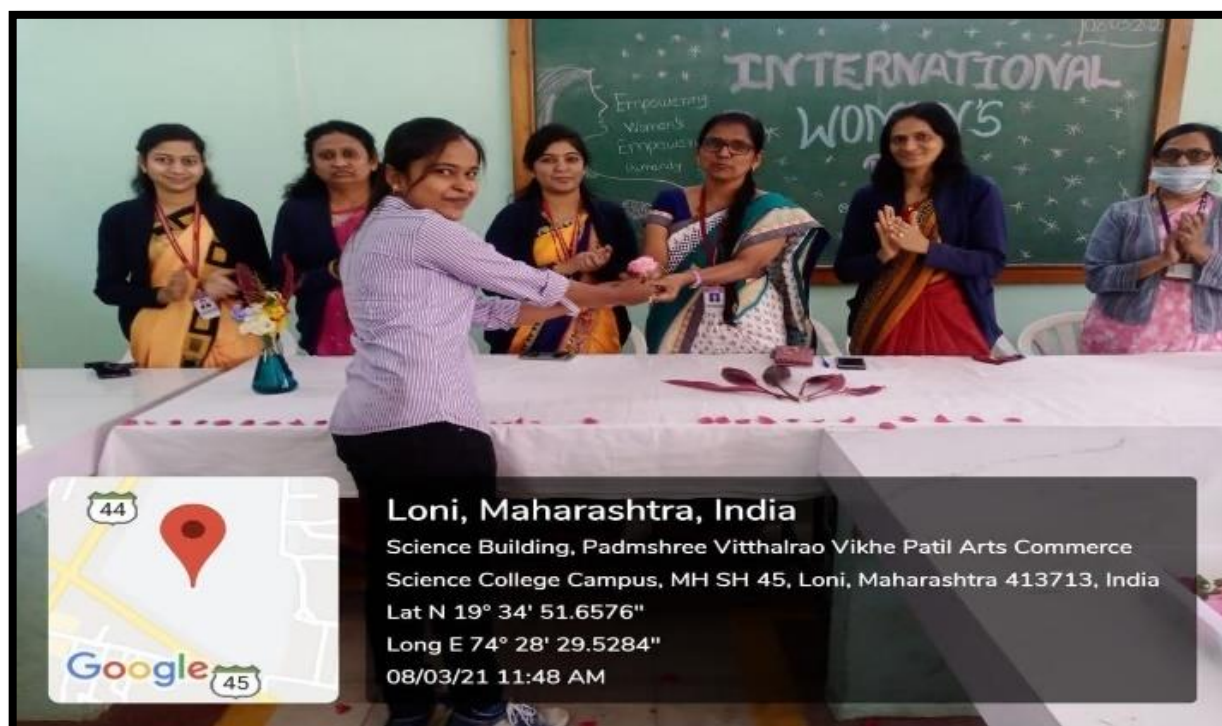
Felicitation of the women staff