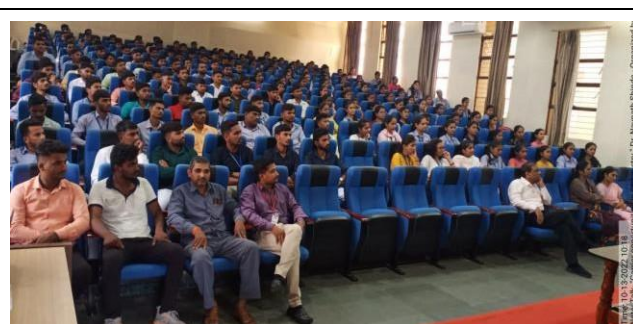
Participant attend Programme of “Carrier Opportunities in different sector” for reserved category students