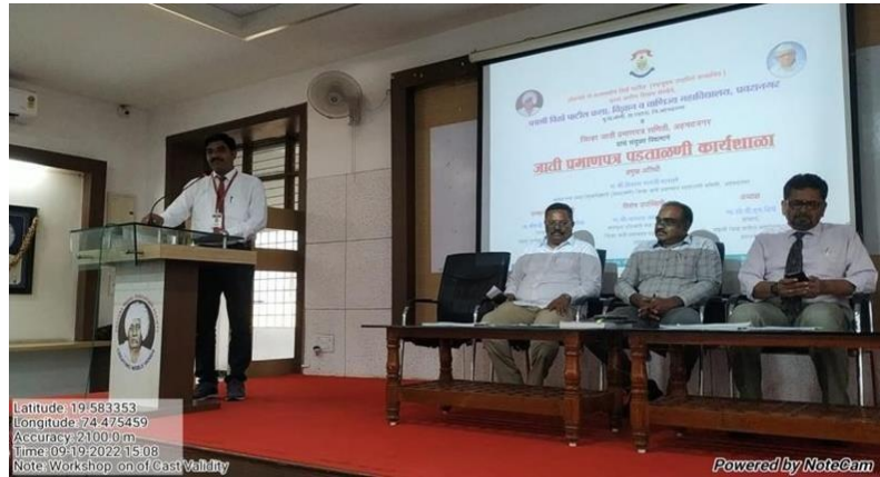
Inauguration of workshop on Cast Validity program 19 September 2022

workshop on caste validity to awareness regarding caste validity certificate 19 th September & 22 nd November 2022,