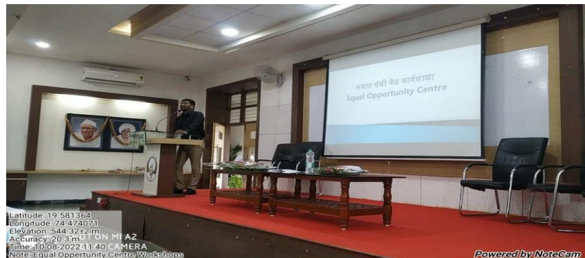
Inauguration of Programme "Workshop on Equal Opportunity" organized by joint auspicious of Reservation Cell & Equal Opportunity Center