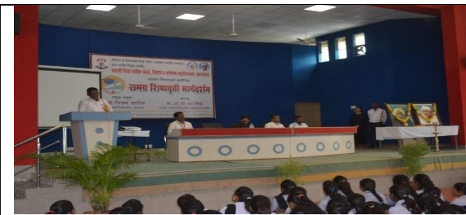
Inauguration of Programme “Total Scholarship Guidance” organized by Reservation Cell