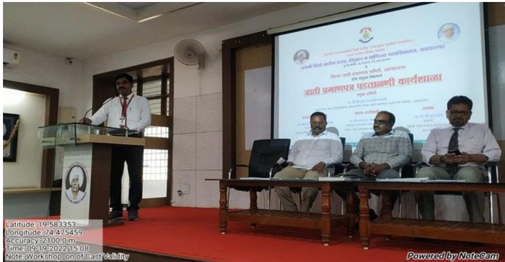
Inauguration of the workshop on the Cast Validity program