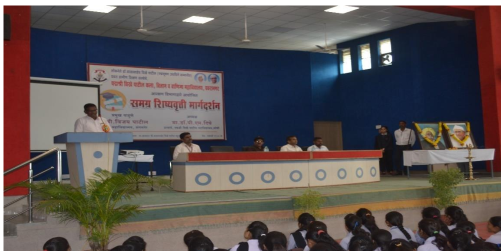
Inauguration of the Programme “Total Scholarship Guidance” organized by Reservation Cell