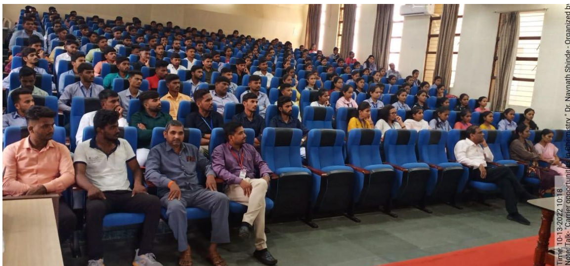
Participant attend programme of “Carrier Opportunities in different sector” for reserved category students