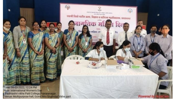
HB Checking of students during the Camp dated 08/03/2022