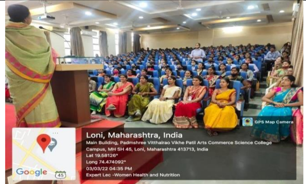
Interaction with the girl students about their various health issues, dated 3rd March 2022.