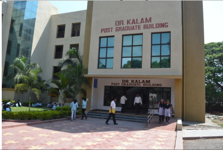
PG Building Ramp