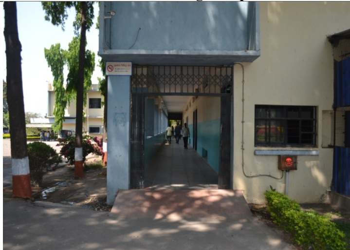
Main Building Ramp