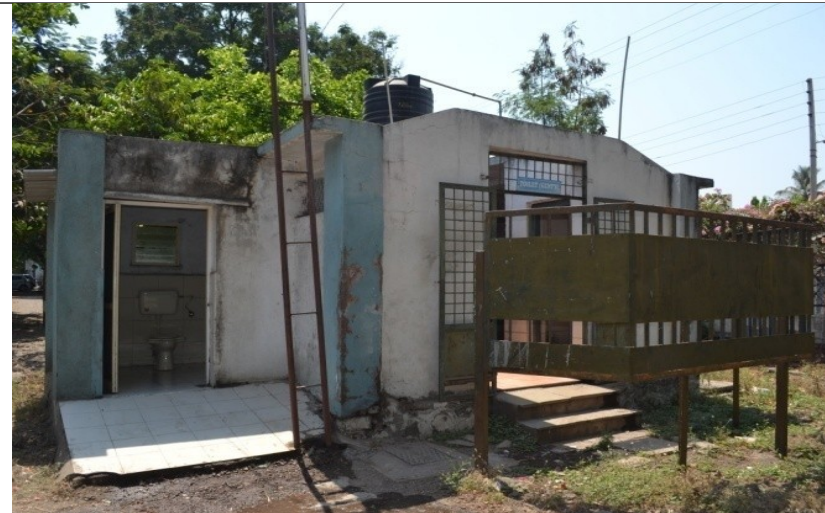
Toilet for disabled students