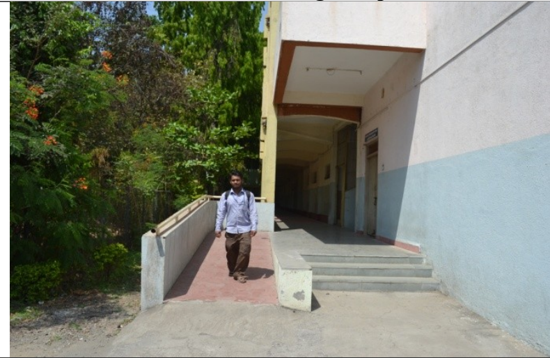
Science Building Ramp